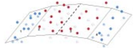
Figure 2. Regression Plane fitted to a cloud of LIDAR points.

Ten test sections along the corridor were used to evaluate LIDAR. Each lane group (northbound and southbound) was evaluated separately by defining a polygon that encompassed the extent of the lane group. Both orthophotos and the LIDAR surface model were used to